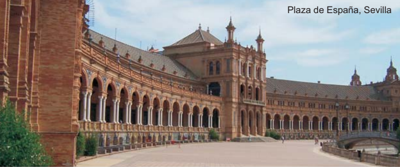
Plaza de España, Sevilla