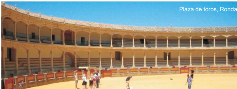
Plaza de toros, Ronda