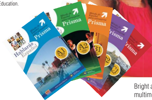
We have our own customized text books

Bright and comfortable classrooms equipped with air conditioning, TV, DVD and CD player, multimedia room, library with a wide range of books, dvd and cds on loan, several computers with free internet access, teachers' room, wifi in all areas. A new cafetería serving breakfast and light lunch every morning.